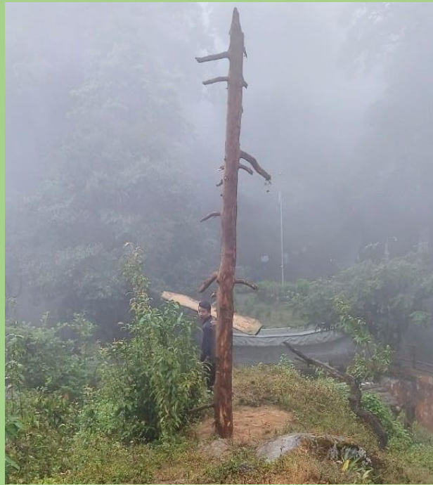
Fig: Installation of resting platform and honey log at Asiatic Black Bear enclosure