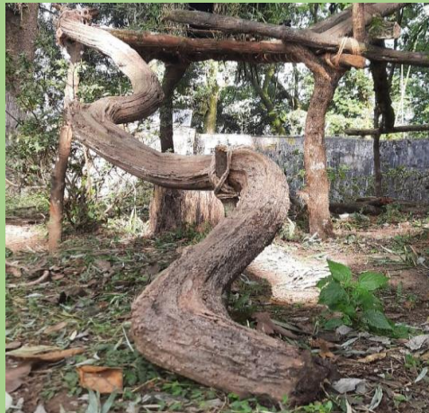
Fig: Installation of new feeding platform & aerial walkway at Red Panda enclosure at PNHZP display