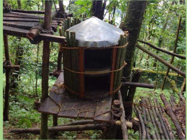
Fig: Repair of cubbing boxes at Old Conservation Breeding Centre Red Panda enclosure