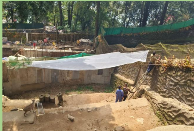
Fig: Installation of feeding platform & shed at Himalayan Goral enclosure