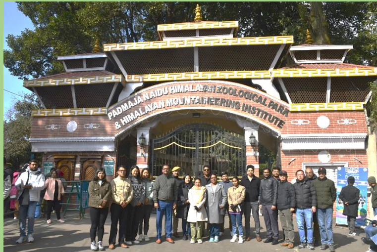
Fig: Visit of Hon'ble Minister in charge of Forest, Miss. Birbaha Hansda at PNHZP on 22.12.24