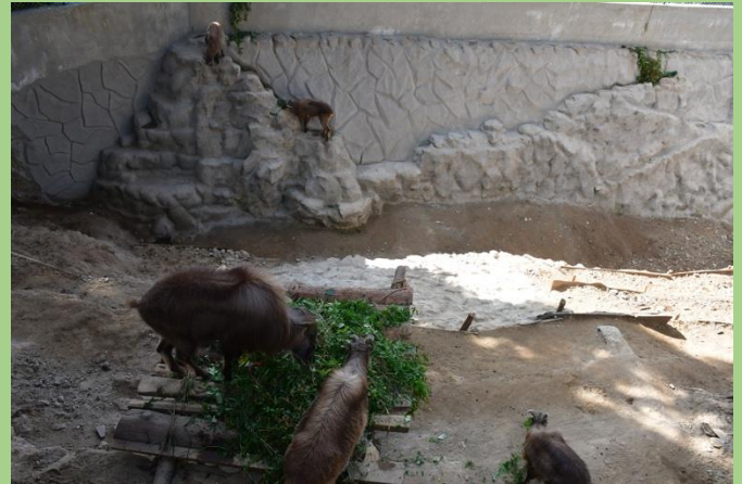
Fig: Renovation of Herbivore enclosure