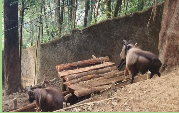
Fig: Installation of new feeding platform at Himalayan Tahr enclosure at PNHZP display